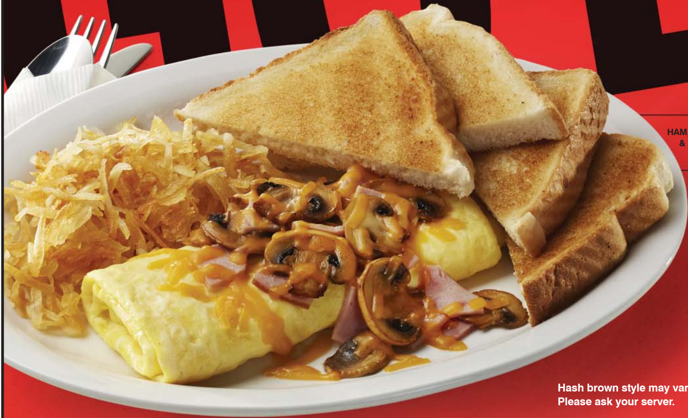
HAM, CHEESE & MUSHROOM OMELETTE

Hash brown style may vary by location. Please ask your server.