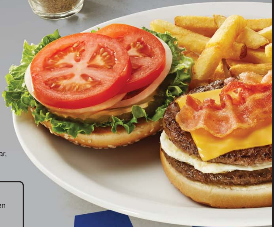
KING OF THE ROAD BURGER

Two beef patties topped with mushroom and Swiss cheese, served with French fries.