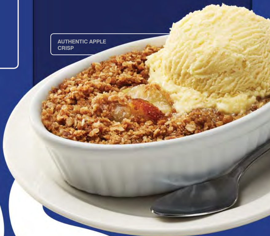
AUTHENTIC APPLE CRISP